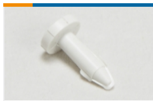
D-Sub Contact Accessories(1)